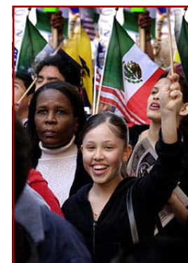
Immigration March - NYC April 10, 2006

Protecting and Defending the Rights of Non-Citizens 2011 marks our 40 th Anniversary Year!